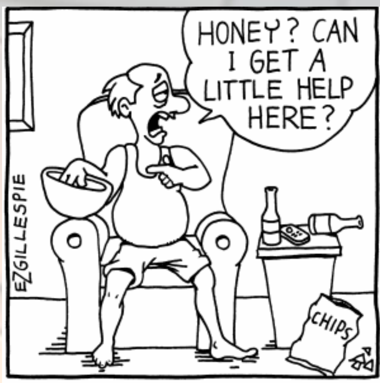
The sluggard buries his hand in the dish; he is too lazy to bring it back to his mouth. ---Proverbs 26:15

Proverbs 26:13-15 A sluggard buries his hand in the dish; he is too lazy to bring it back to his mouth. (15)